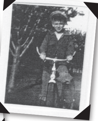
One happy boy "catch'n" the train!