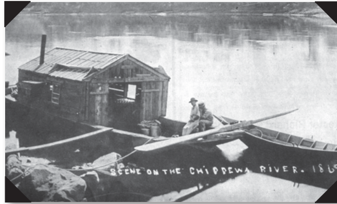
Wanigan – What? It's the floating restaurant where the cook lived and feed the loggers as they rode the log booms down the Chippewa River to the saw mill at Chippewa Falls.